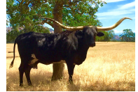
JH MONIKA'S SUN