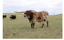
NIGHT SAFARI BL833