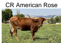
CR American Rose