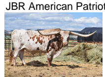
JBR American Patriot