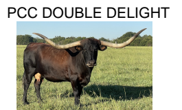
PCC DOUBLE DELIGHT