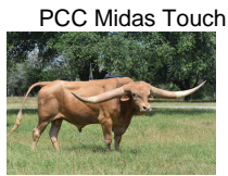
PCC Midas Touch