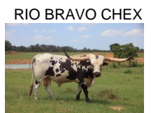
RIO BRAVO CHEX