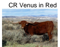
CR Venus in Red