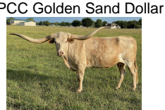
PCC Golden Sand Dollar