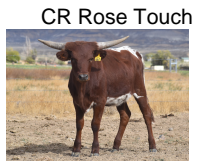
CR Rose Touch