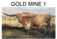
GOLD MINE 1